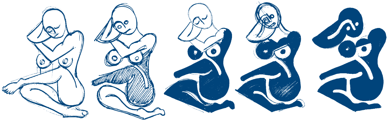
Process sketches and renderings for mural, 2011

Drawing Salon Party: Saturday, June 4, 2011, 9pm-1am