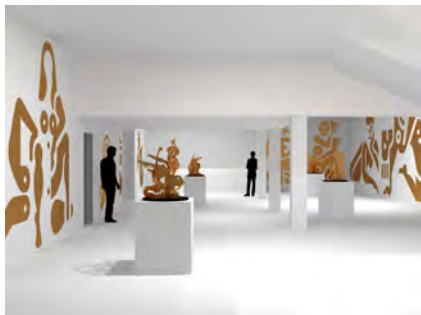
Trophies, 2011, renderings of exhibition; each sculpture: welded aluminum and gold paint, 32 x 24 x 24 in.