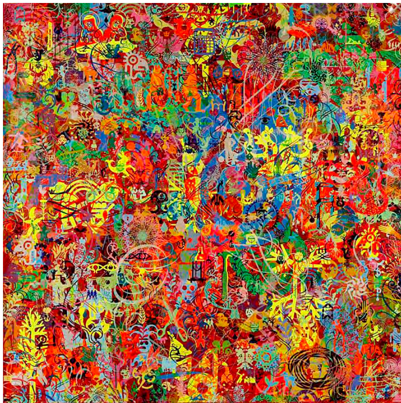
Brain Drain , 2008, acrylic on canvas, 96 x 96 in.